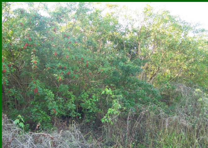
Brazilian Pepper before treatment

The goal of this mitigation work was to achieve less than 5% exotic and nuisance population density. It has been successfully met and the land is now in a native condition and will be monitored and maintained for five more years.