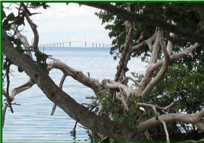
Maintenance of mangroves along Sunshine Skyway

The goal of the work is to maintain nuisance/exotic species, as defined by FLEPPC, at less than 5% of the population density and to promote mitigation site and storm water site function.